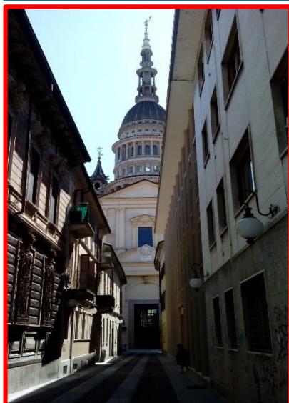
NOVARA, 5-6-7 October 2016 SCIENTIFIC and CULTURAL PROGRAM