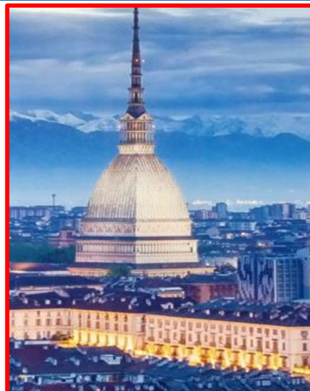
TORINO, 8 October 2016 SOCIAL EVENT and FAREWELL PARTY